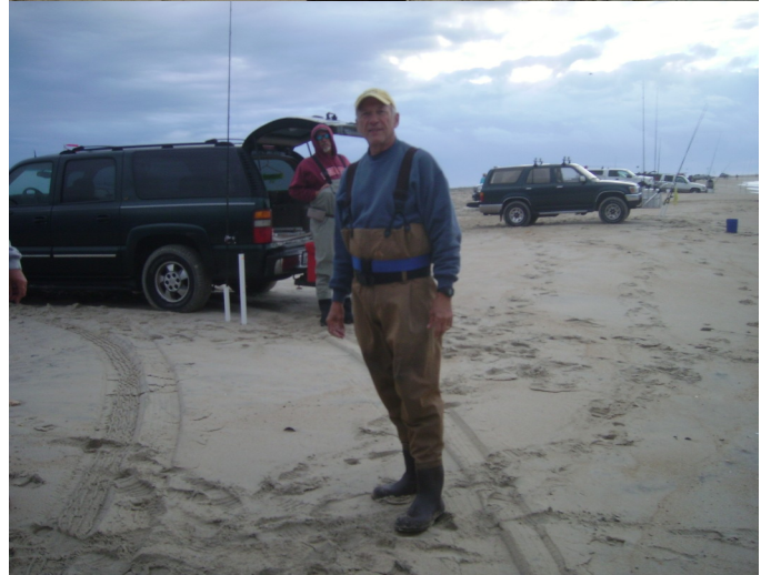
Hatteras Surf Tournament